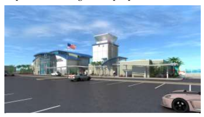
Project designed by Development One, Inc. Architects, J. Bruce Camino, NCARB, AIA

meeting. The design calls for an entirely new stand-alone building next to and just west of the current airport administration building. Features would include new office space for airport staff, a large multipurpose room, and a